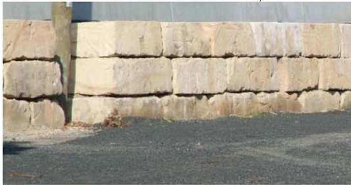
SANDSTONE LOG RETAINING WALL