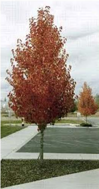
PYRUS CALLERYANA "CAPITAL" (ORNAMENTAL PEAR)