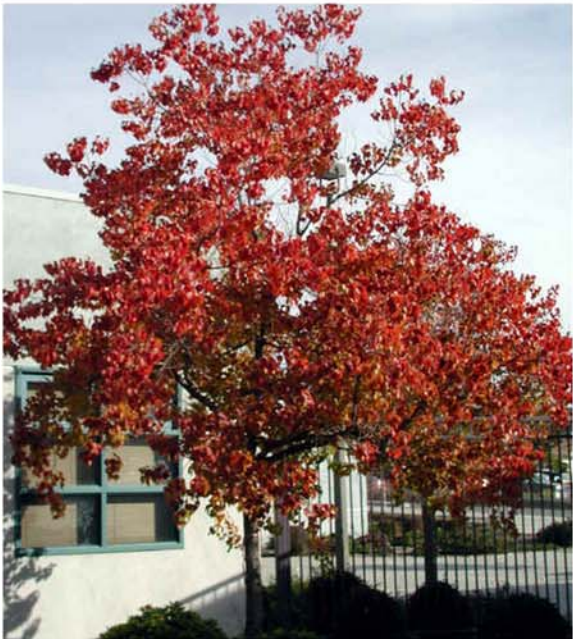
SAPIUM SEBIFERUM (CHINESE TALLOW WOOD TREE).