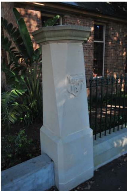
STONE COLUMNS TO BE REPEATED ON ENTRY