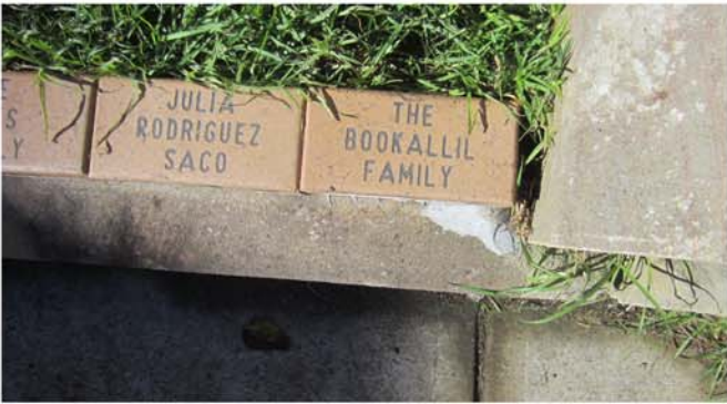
DONOR BRICKS TO BE RELOCATED WITHIN PAVING